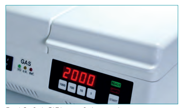
Fig. 4 Otoflash G171 xenon flash-curing device.

The workpiece can now be returned to the cast. Given adequate experience in splint design and a proper fabrication approach, minimal – if any – finishing will be required. If the clinical procedure that resulted in the working materials and documents was performed diligently, the effort required to adjust the static and dynamic occlusion will be equally minimal.