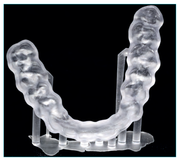
Fig. 3 Cleaned splint on a carrier plate.

The supporting structures are separated and light-cured to final hardness using the Otoflash G171 xenon flash-curing device by NK-Optik (Baierbrunn, Germany) (Fig. 4). This requires 2 \times 2,000 flashes of light while rotating the object in an protective atmosphere (nitrogen 5.0). This is a crucial step to ensure biocompatibility and to avoid the formation of an inhibition layer on the splint's surface.