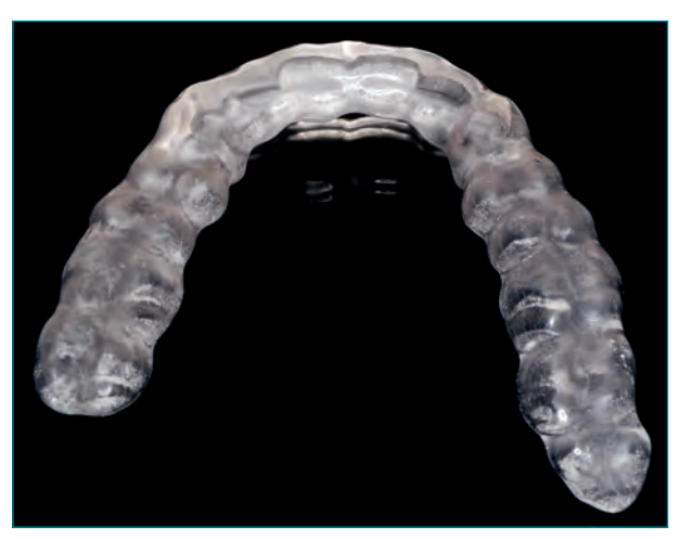
Fig. 5 Splint polished to a high luster.

A key issue, however, could be the materials' properties, for which adequate long-term evidence is still unavailable. While one type of splint is milled from a homogeneous block of material (subtractive procedure), the other type is built up layer by layer from a resin solution (additive procedure). To what extent this might influence any relevant properties of the material from which the splint is made, such as fracture behavior or long-term abrasion stability, remains to be determined by laboratory testing and clinical trials.